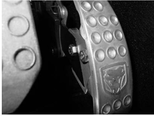
This Kit Moves the Gas Pedal ¾" towards the driver to aid with heel and toe position with brake pedal.